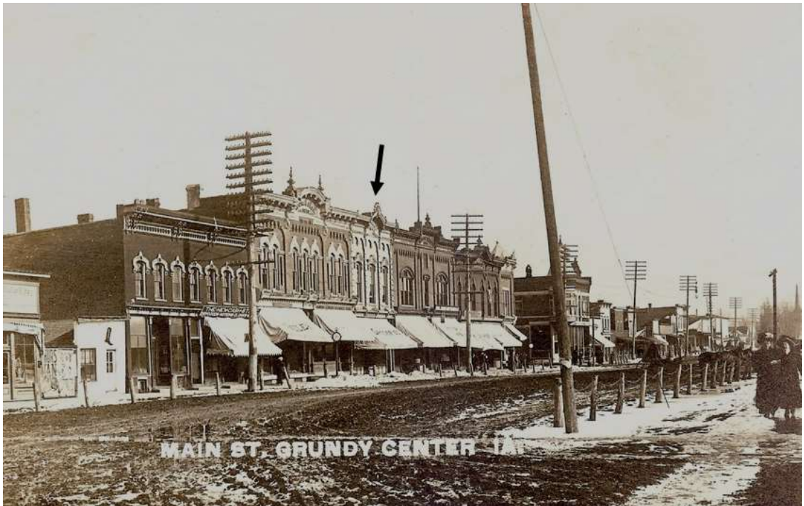
View northwest of 700 block of G Avenue with H.G. Geer Block indicated (arrow), 1890s