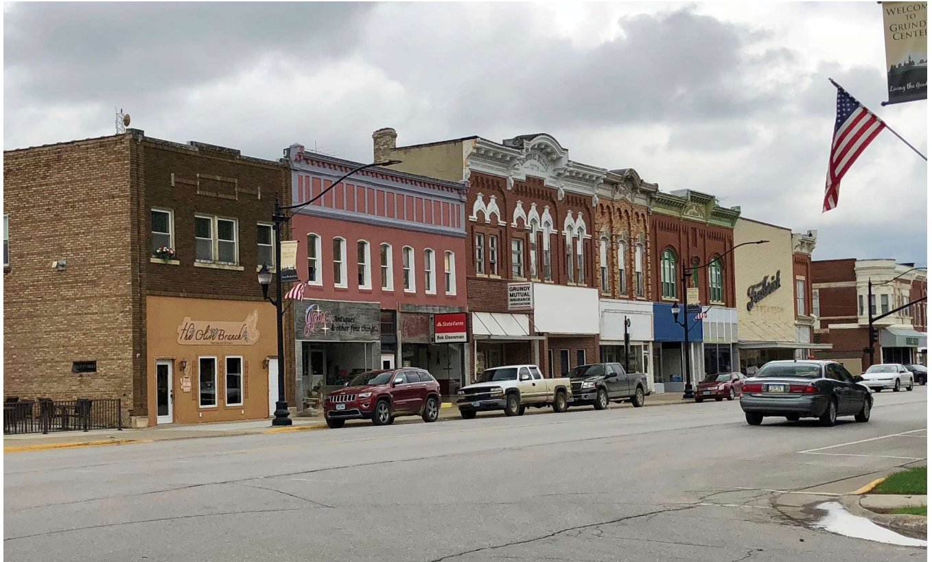
General view northeast