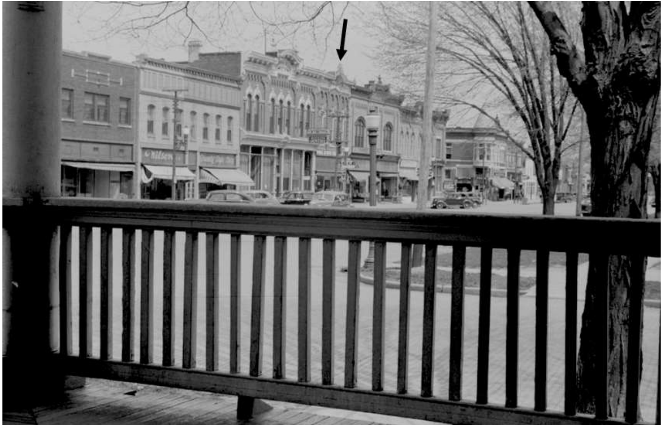
View northeast with H.G. Geer Block indicated (arrow), c.1940