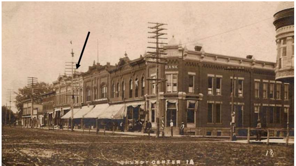
View northwest of 700 block of G Avenue with H.G. Geer Block indicated (arrow), 1900s